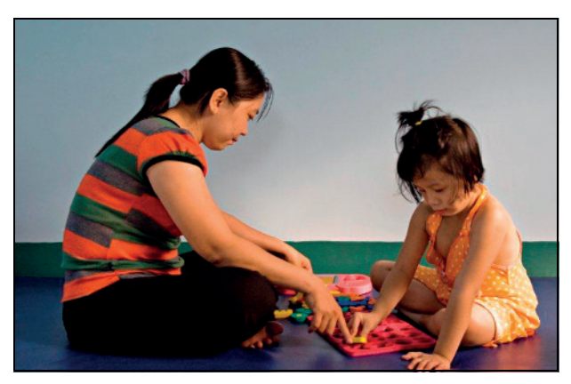
Figure 5.1 The work of the Norwegian Mission Alliance in Vietnam: stimulation in early childhood is important.