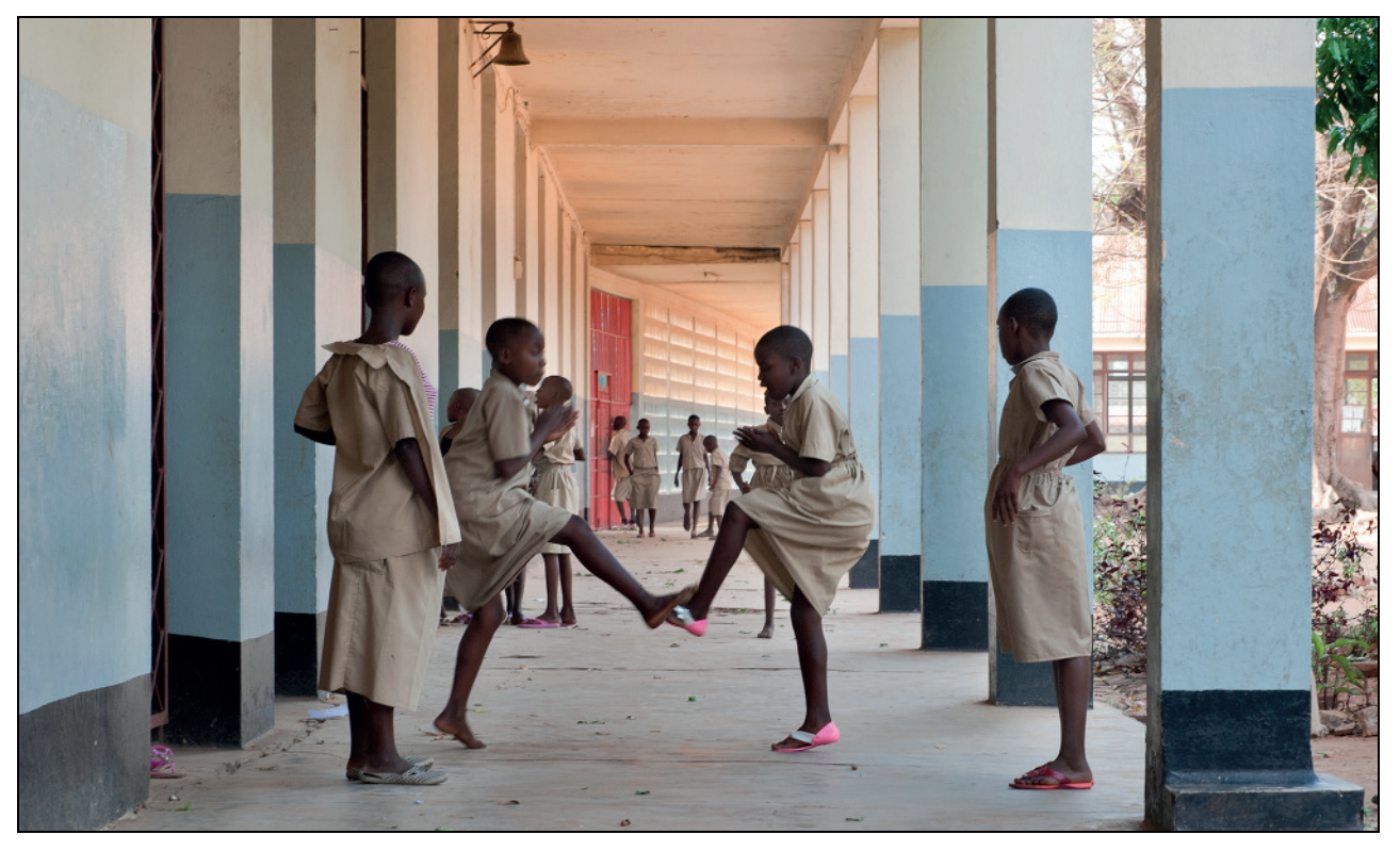
Figure 3.1 School break at Stella Matutina school in Burundi.

Norway's strategy is to join forces and agree on common goals, mobilise increased resources and promote coordinated efforts at both global and national levels; we will also seek to strengthen educational systems at country level. The goals are to be achieved in cooperation with a large network of international and national organisations and specialists in the field. Altogether, this is expected to increase effectiveness and to move