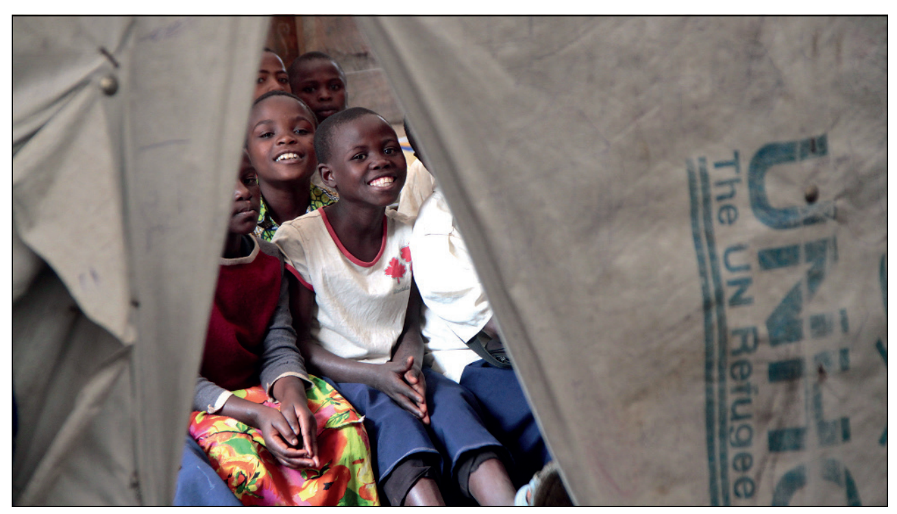
Figure 3.4 Education in Emergencies , the Masisi district in DR Congo. (Norwegian Refugee Council, supported by the European Commission's European Community Humanitarian Office (ECHO) and Norway)