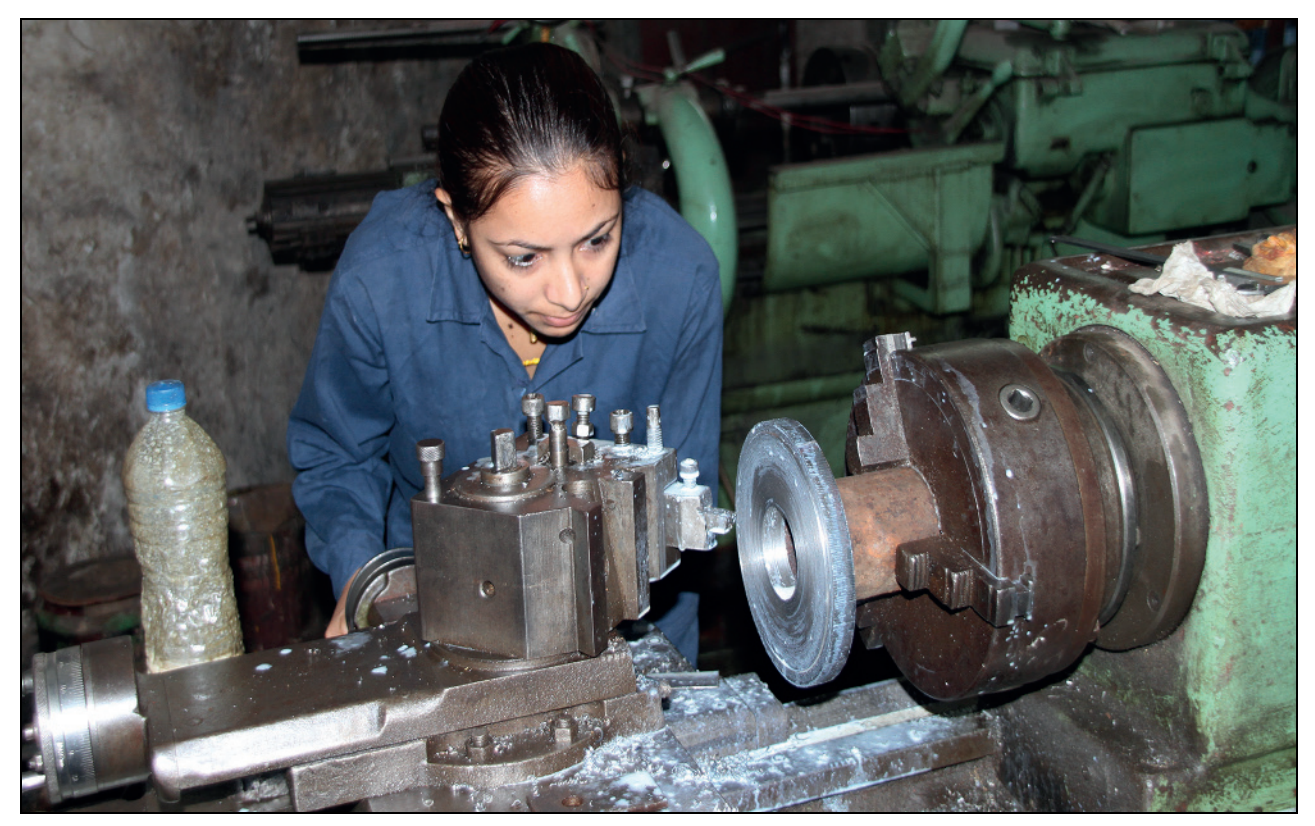
Figure 3.6 A girl in vocational training in Nepal.

Worldwide, today's generation of young people is the largest in history on a worldwide basis. This generation has talent, energy and new ideas that society should make use of. With the right mea-