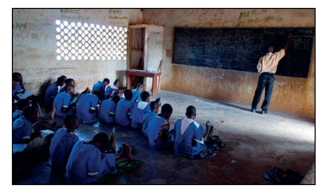
Figure 5.2 At school in Malawi.

In countries where we go in bilaterally, we will enter into partnerships with the national authori-