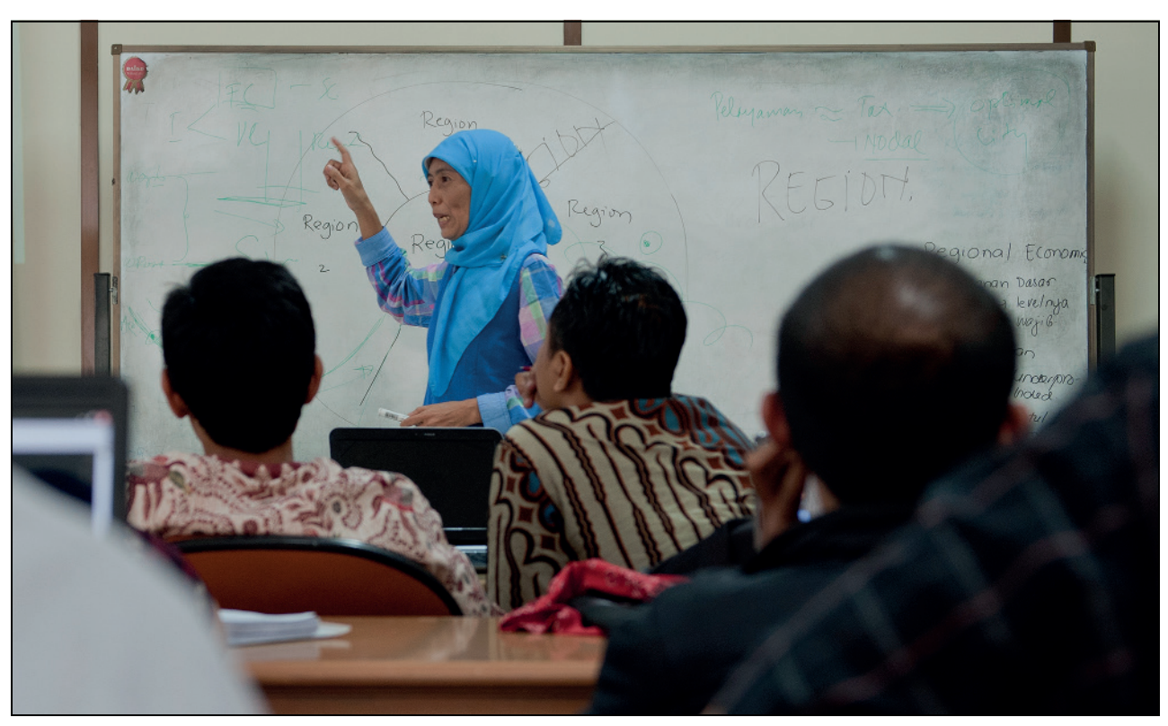
Figure 3.5 Gadjah Mada University in Indonesia.

countries that are struggling to build up sustainable education systems that provide good, effective learning environments. There is no standard solution, as the keys to success vary significantly from one country to another. However, there are certain factors that are essential. First and foremost, adequate financing is needed. This means that education must be given priority in government budgets. Furthermore, national ownership and leadership are crucial in order to bring about the reforms needed to build education systems that give all children and young people equal opportunities to receive a good, relevant education.