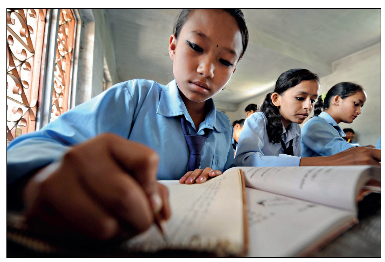
Figure 2.1 Schoolgirls in Nepal in deep concentration

No. 182 on the Worst Forms of Child Labour states that each member state is to implement measures to prevent child labour in light of the importance of education.