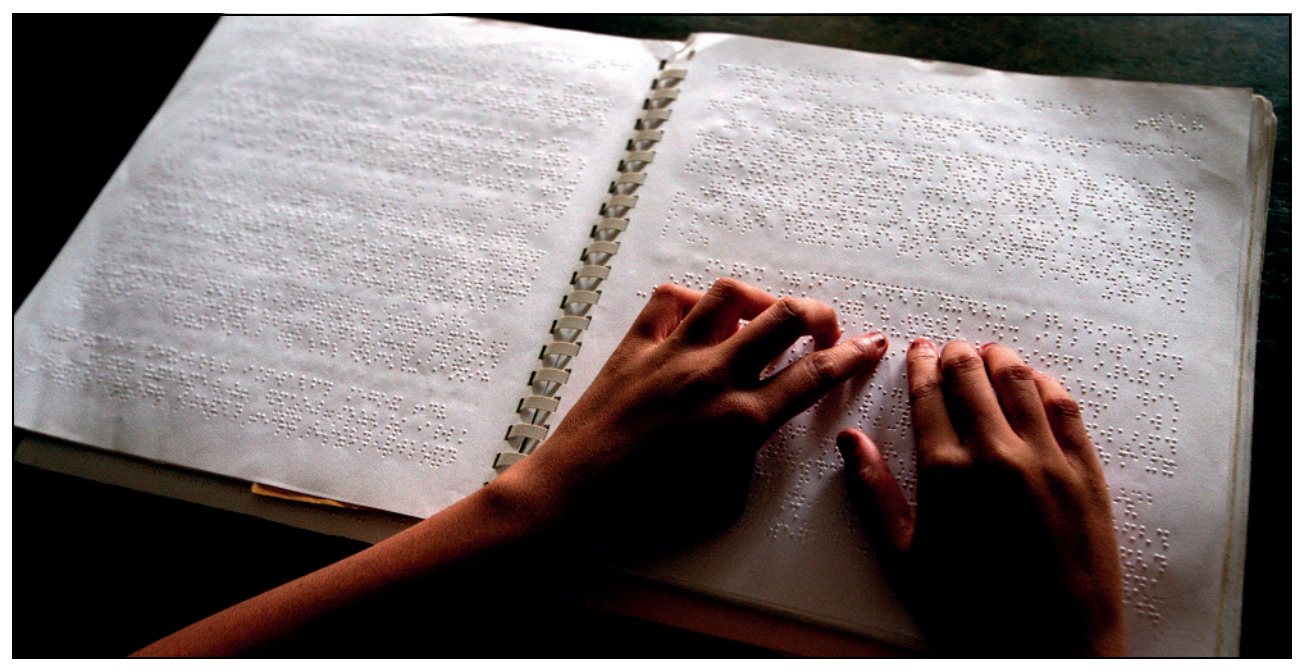
Figure 3.2 A blind child reading at a school in Bangladesh

learning about food production and cooking nutritious meals, which is relevant and useful for the children's families.