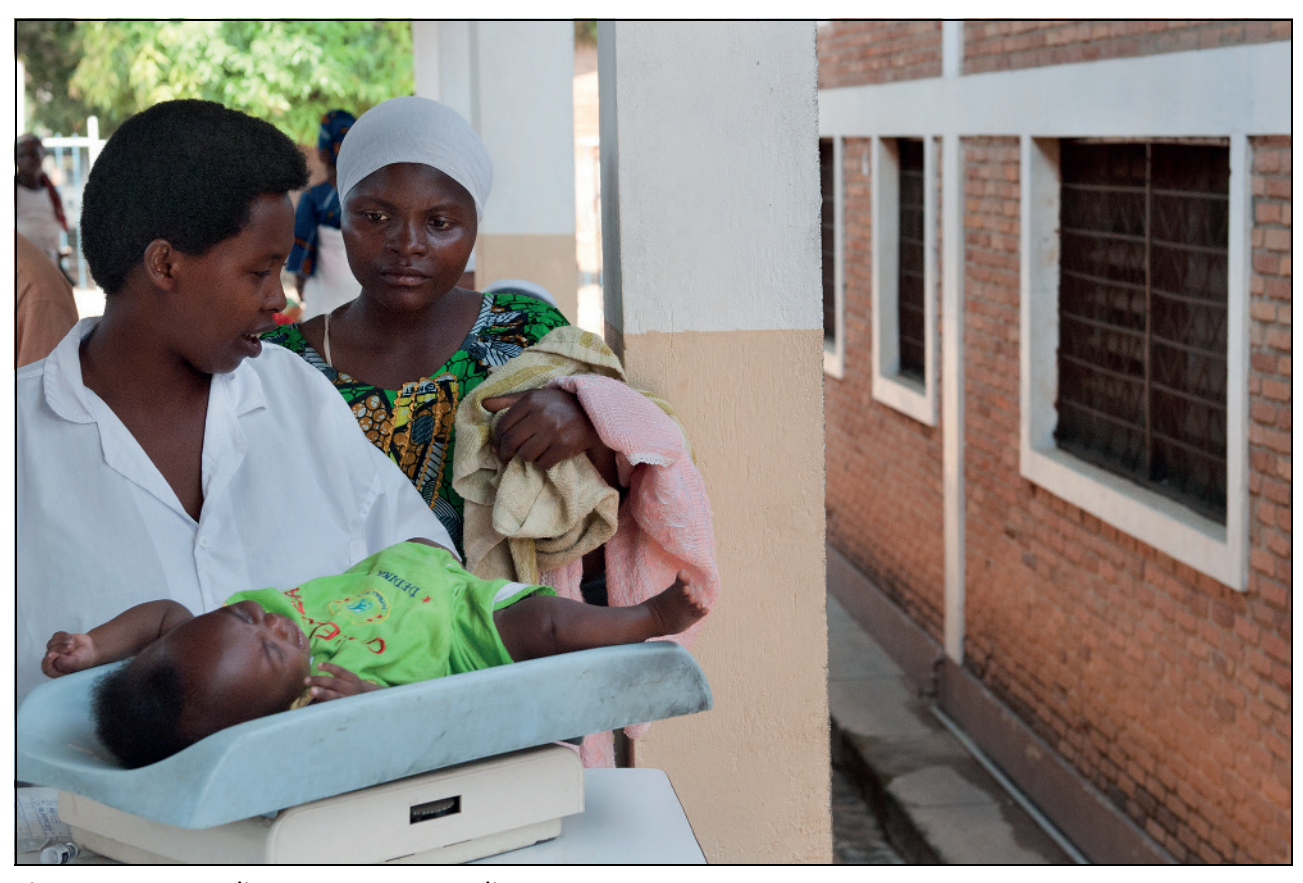
Figure 2.3 Burundi: Proper care saves lives